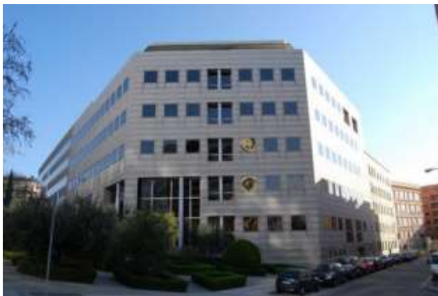
■ The IOC's headquarters on Calle Principe de Vergara 154 in Madrid

http://www.internationaloliveoil.org/store/index/48-olivæ-publications